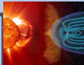
Figure 1 Here is a diagram of coronal mass ejections, it also shows how the solar flares and solar winds go to Earth with the charged ions.

The aurora is a display of lights that form in two places, the North Pole, and the South Pole. They are normally called the Northern and Southern lights, although there is a full name of The Aurora Borealis (The Northern Lights) and Aurora Australis (The Southern Lights). If you look at figure 2 it shows how the aurora looks from space and that it is around the poles. In some mythologies when the aurora was around, it was thought of as a symbol that a war was about to happen. The aurora often form about 80 miles to 620 miles up, so very high. I will be talking about how the aurora differs year from year. I will investigate the different colours and how it is dependent on the solar cycle.