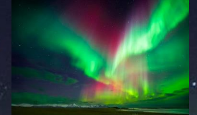
Figure 3 shows the variation of colours of the aurora and the it shows colours in layers depending on the position of the atoms.